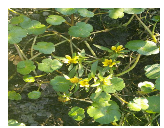
On little Si near the bottom anything goes.

These were on the Little Si trail. I think there are 2 different plants My guess on this mystery plant (which I really am not sure about) is probably some aquatic or disturbed area weed like water primrose and the bigger leaves are something else like maybe marsh marigold.